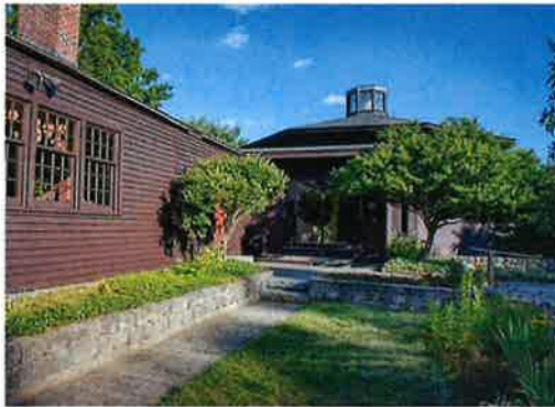
Meticulously Cared For