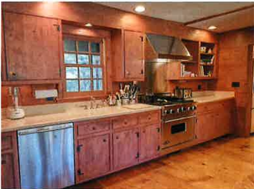
Viking Professional Stove