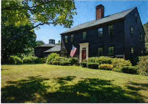
Shaker Brook Farm