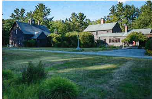
Plenty of Open Space