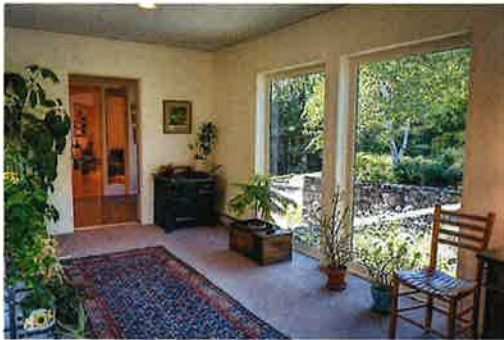
Breezeway to Octagon