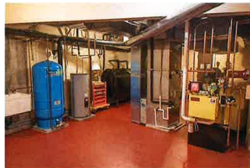
Systems Room in Octagon