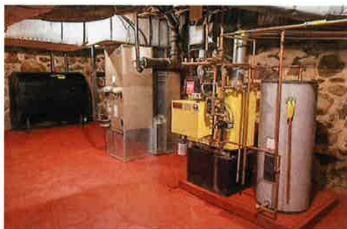
Systems Room in Main House