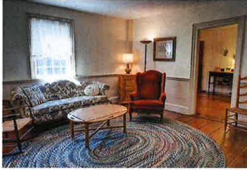
Sitting Room off Dining Room