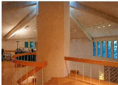
Upper Level in Octagon