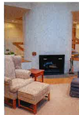
Fireplace in Living Room