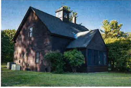
Guest House with Screen Porch