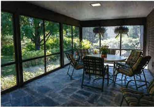
Main House Screen Porch