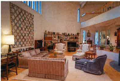
Opposite View Living Room