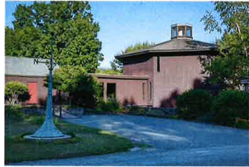
A Welcoming Home