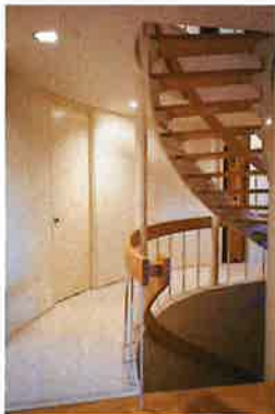
Curved Stairway in Octagon