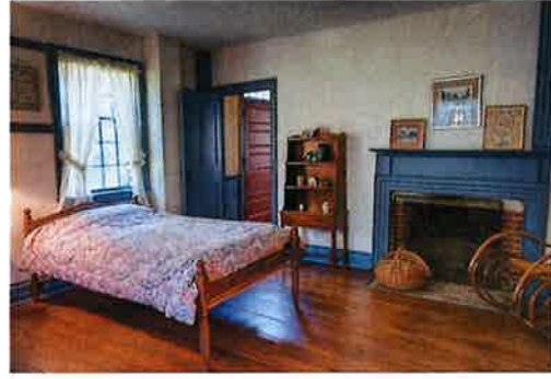
1st First Floor Bedroom