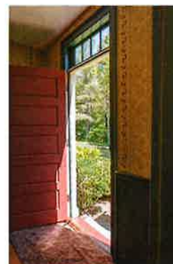
Let's Go Out & Explore