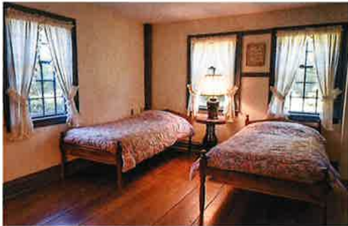
2nd First Floor Bedroom