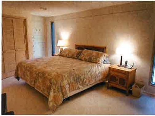
Large Master Suite